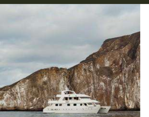
Day 3 Santa Cruz Island - San Cristobal Island

In the morning, we will transfer to Puerto Ayora where we will board our speed-boat for the 2-hour transfer to San Cristobal. On arrival, we will visit the Interpretation Center located at the northern edge of town. The Center provides great information about this fascinating archipelago, including the natural history of the Islands as well as the impact of humans on the ecosystem. You will also learn