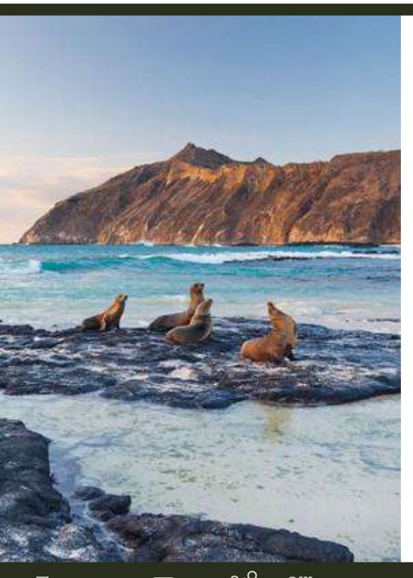
Day 1 Baltra Island - Santa Cruz Island

'The Mountain and The Sea' will allow travelers to embrace the romance of exploration and discovery in the Galapagos with a true local flavor. We promise they'll fall head over heels.